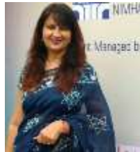
Rtn Mini Pushkar Nov 2018